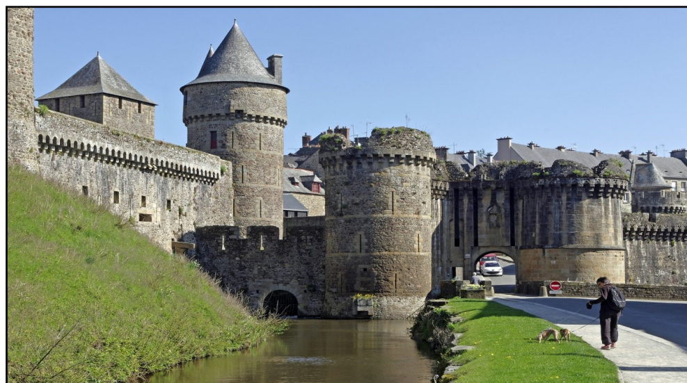
The imposing castle at Fougères