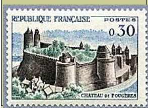
Fougères castle - known throughout France