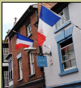
Solidarity with France. But where is this?